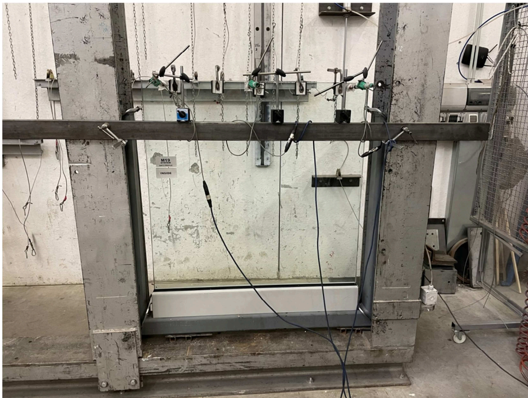
Photograph of the item

Further details of item specifications in annex "A".