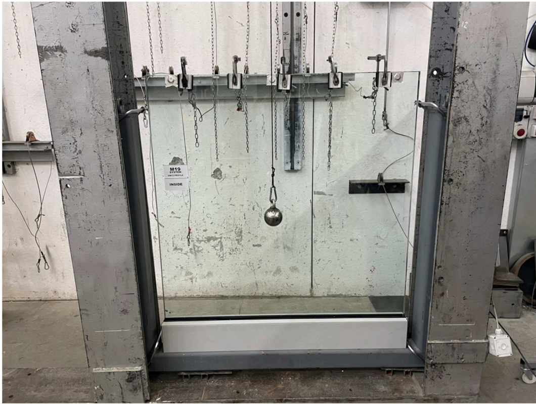
Photograph of item after hard-body impact in the centre of glass