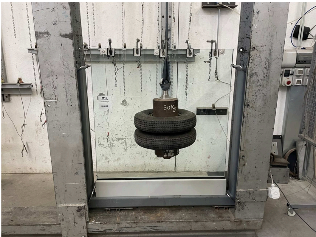
Photograph of item after semi-rigid impact in the centre of glass