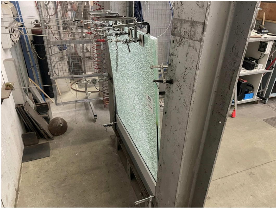
Photograph of item subjected to post-breakage load