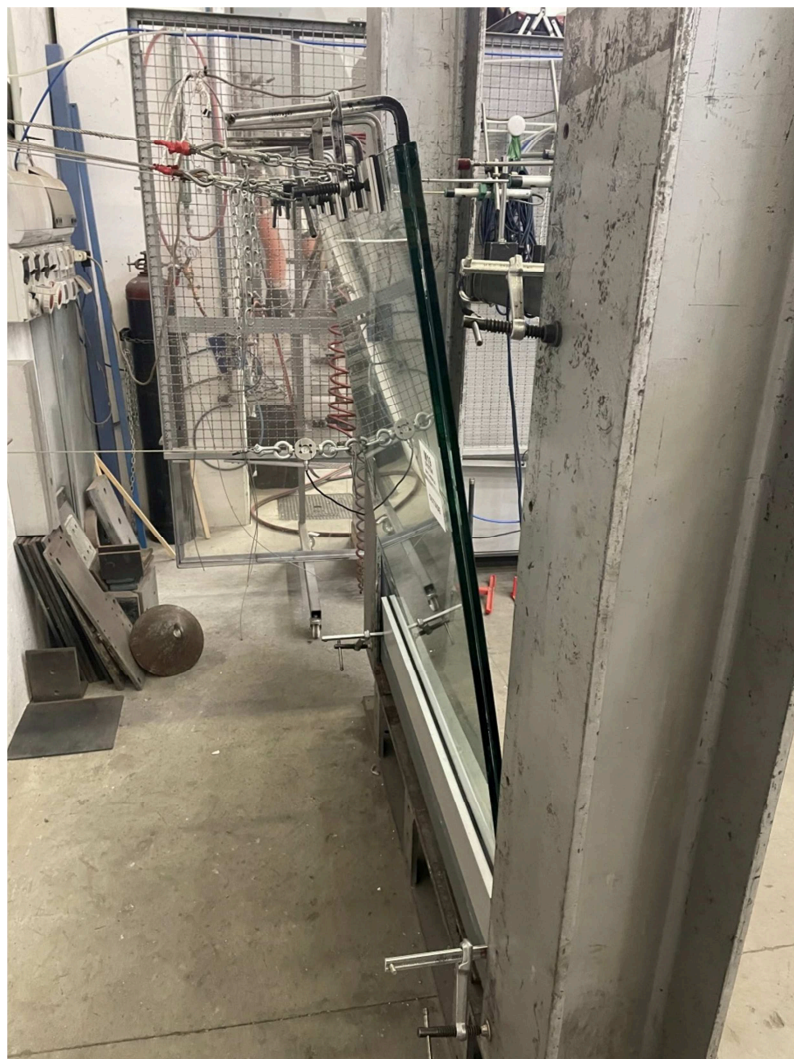
Photograph of item during resistance to ultimate limit state loading test