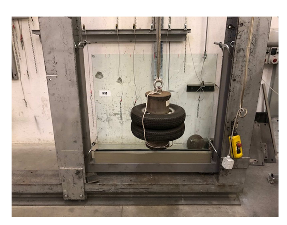
Photograph of the railing after double-tire body impact