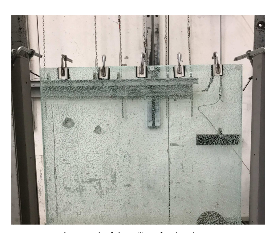
Photograph of the railing after breakage