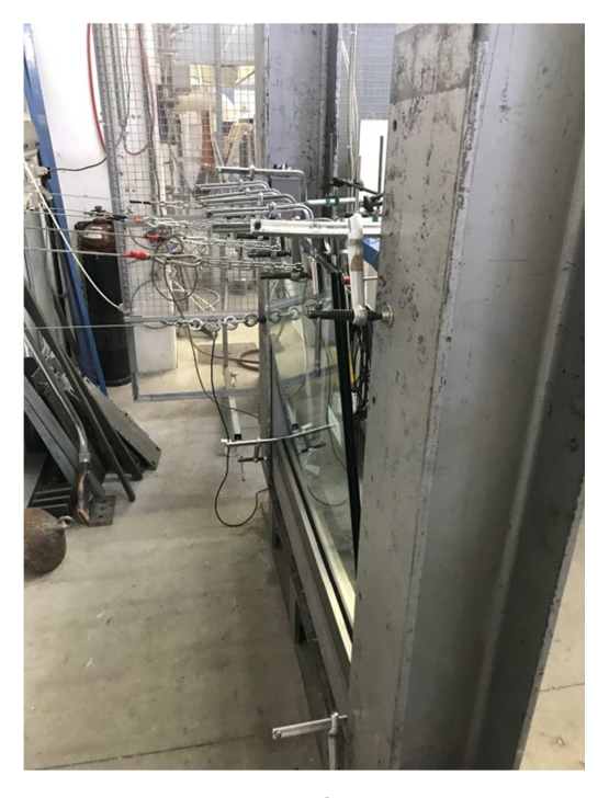
Photograph of the railing subjected to working load