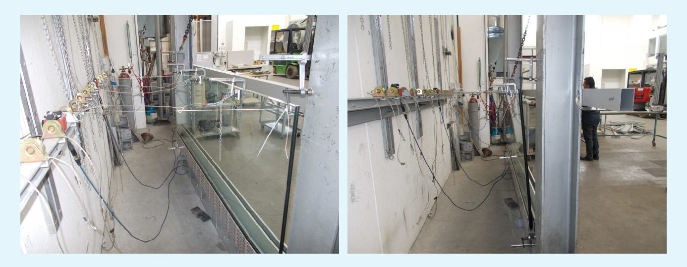
Photographs of the sample during outward horizontal static loading test