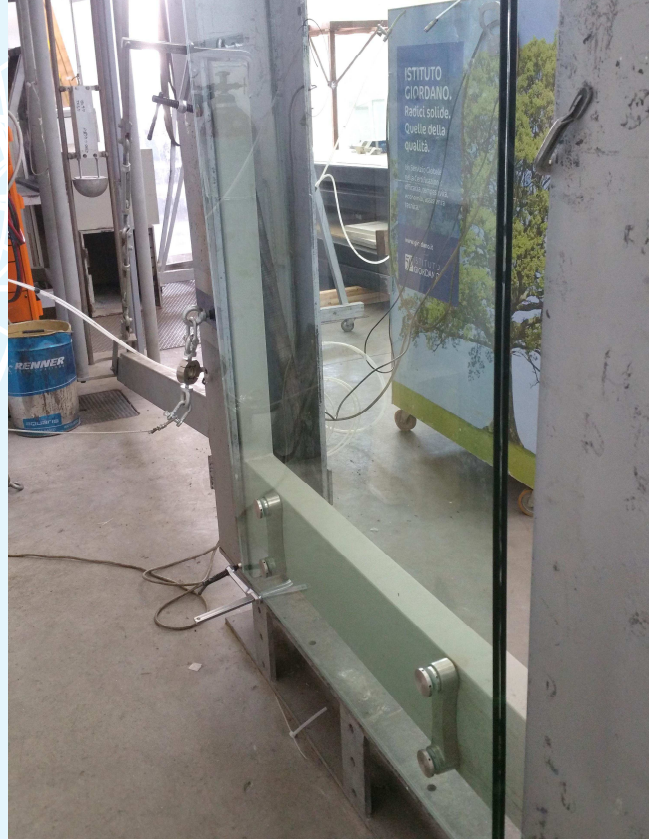
Photographs of the sample