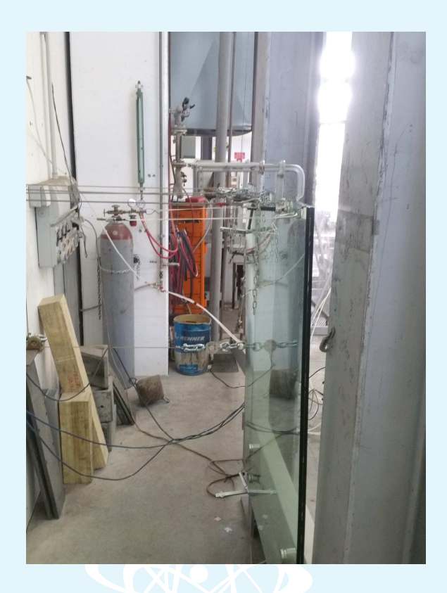
Photograph of the sample during outward horizontal static loading test