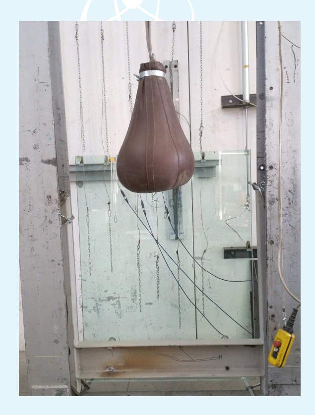
Photograph of the sample after impact in the centre of infill